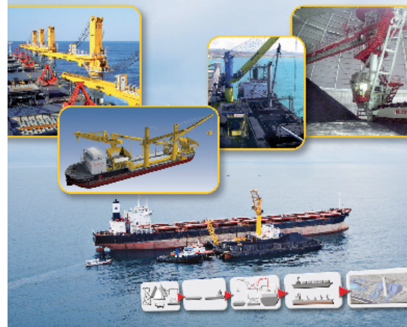
Title cover: Bulk Logistic Landmark