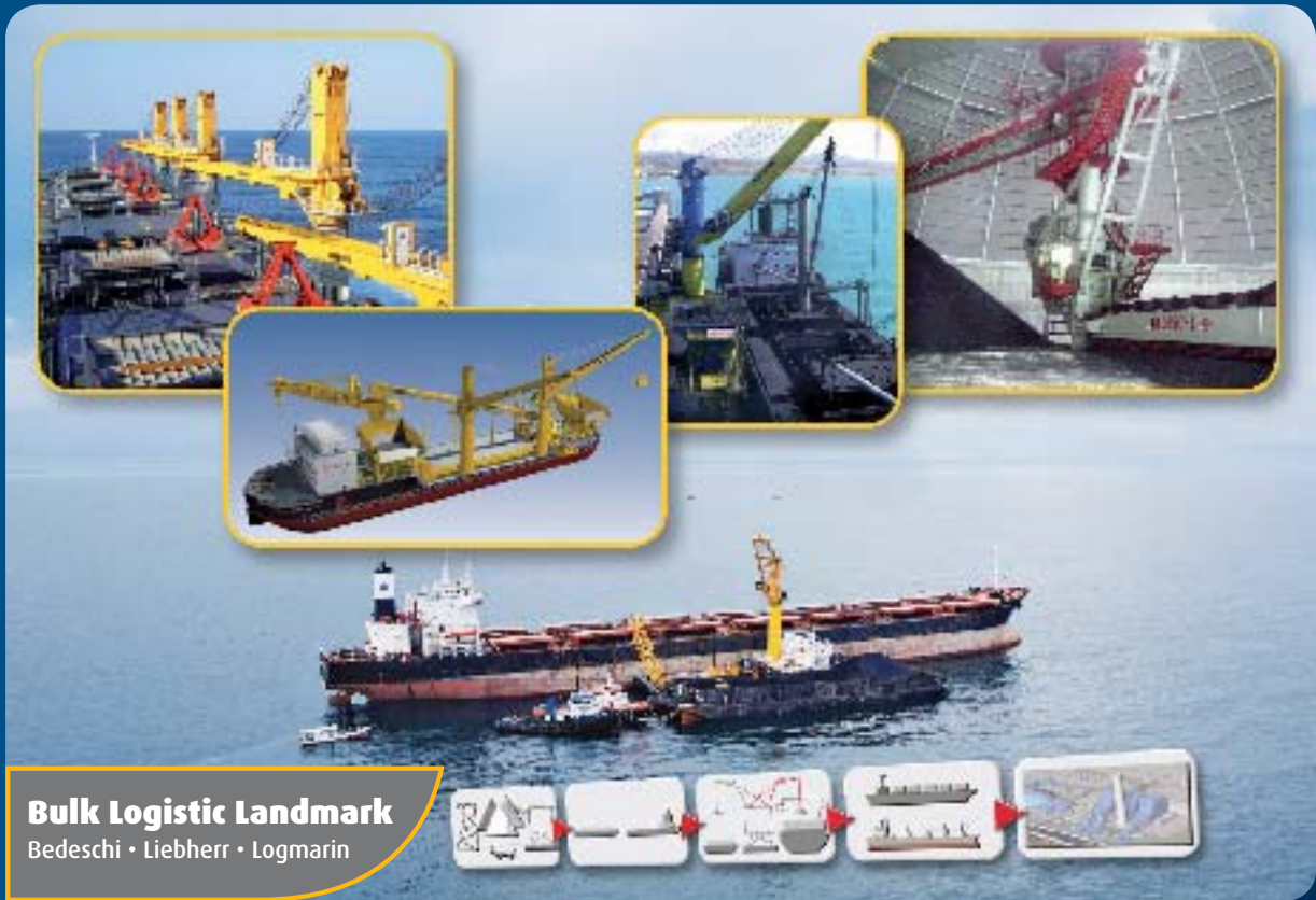
Bulk Logistic Landmark Bedeschi • Liebherr • Logmarin